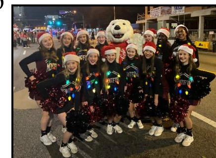
The M.M.S. cheer team poses with the Coca-Cola bear before the parade.

The Montford cheerleaders performed in the Tallahassee Winter Festival Parade. The cheerleaders worked hard to learn a dance to perform and won 1 st place in the school category in the 2022 Winter Festival Parade! Way to go girls! The Cheerleaders work hard to show the school spirit and that is exactly what they did at the parade! They represented us in a cheerful way! Let us thank the cheer coaches